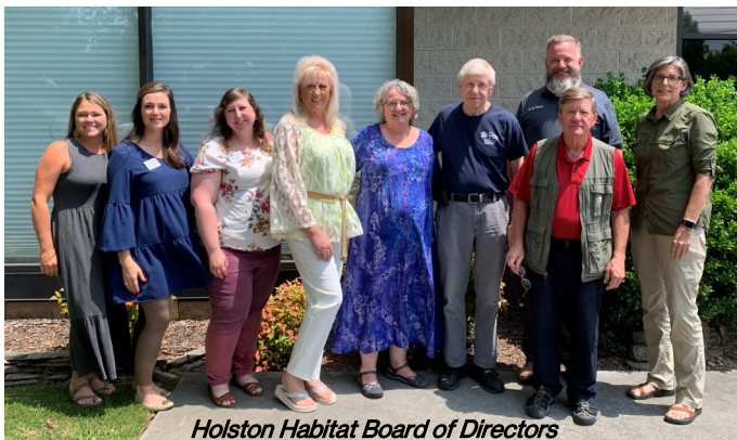
Holston Habitat Board of Directors