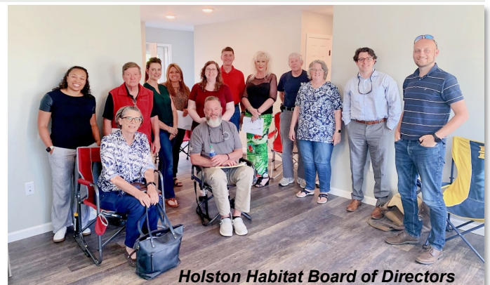
Holston Habitat Board of Directors