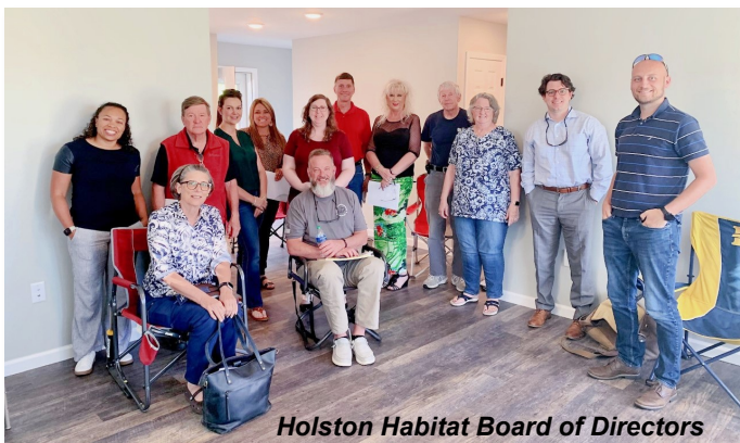
Holston Habitat Board of Directors